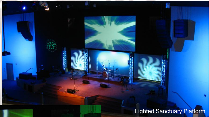
Lighted Sanctuary Platform