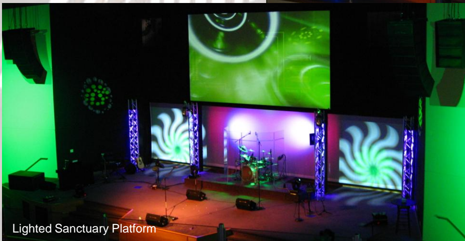
Lighted Sanctuary Platform