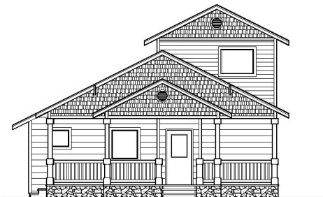
New Front Elevation